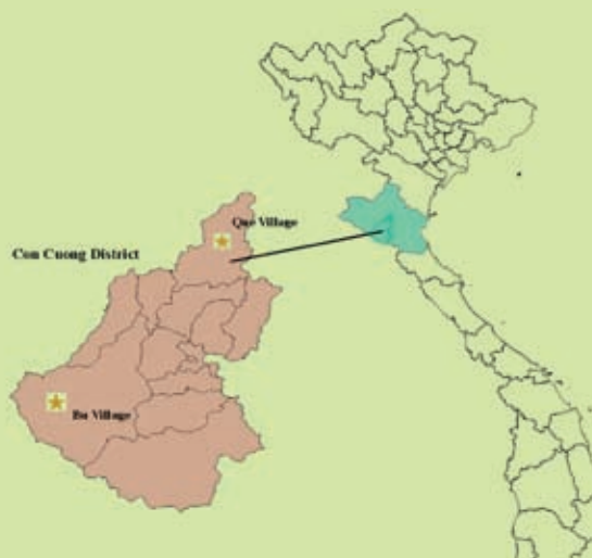
Figure 1: Location of the Study

This brief argues that if the villagers' forest management rights had been strengthened, food security issues could have been solved in these villages. We assert that although FLA has resulted in some positive effects for local people in some villages, food shortages are becoming more frequent at household levels, leading to food insecurity for many villagers. Our assertion is based on findings from two case studies in two poor villages (Bu village in Chau Khe commune and Que village in Binh Chuan commune of Con Cuong District, Nghe An Province) where local livelihoods were mainly based on income from swidden (slash-and-burn) agriculture in forests. Data collection took place in 2005 and 2010.